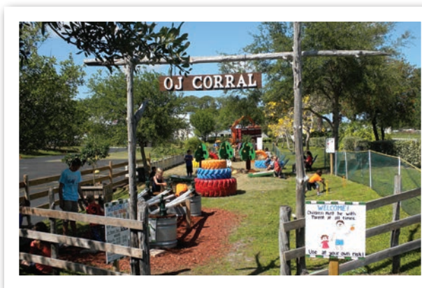
The O.J. Corral - Al's "Agri" playground and Observation-grove is great fun for all ages.

Al's Red Barn Grill is our family owned and operated grove-side café located at 2005 N. Kings Hwy at the entrance to the Kings Highway Industrial Park.