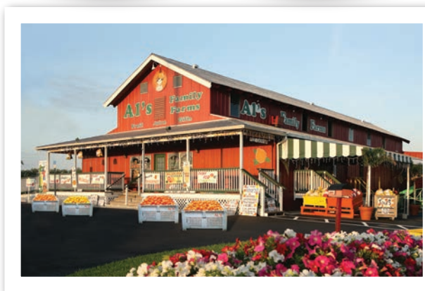
Al's Family Farms historic big red barn.