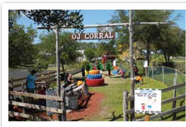
The O.J. Corral - Al's "Agri" playground and Observation-grove is great fun for all ages.

Al's Red Barn Grill is our family owned and operated grove-side café located at 2005 N. Kings Hwy at the entrance to the Kings Highway Industrial Park.