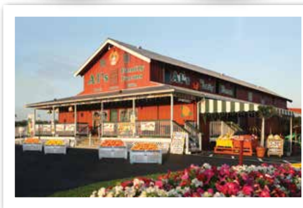
Al's Family Farms historic big red barn.