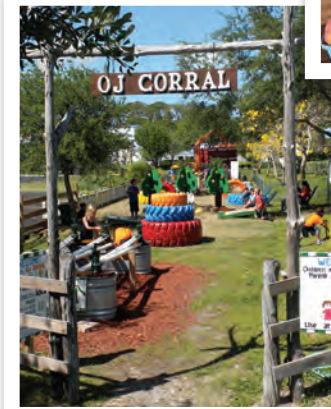
The O.J. Corral Al's "Agri" playground and Observation-grove is great fun for all ages.

AlsFamilyFarms.com/info/tour.php (Self Guided Tours now available. Much to see and do).