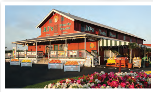
Al's Family Farms historic big red barn.